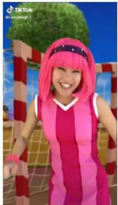
This tiktoker made many of her followers relive their childhood, imitating Stephanie in several of her videos. A total lazytownner.